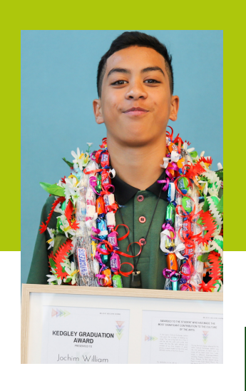
TERM ONE 4 February -16 April