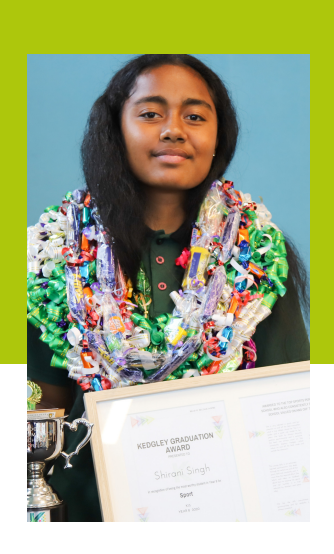
TERM TWO 3 May -9 July