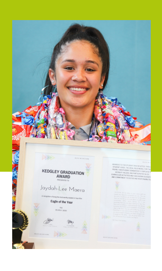
TERM FOUR 18 October -16 December